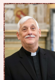
Very Rev Fr Arturo Sosa SJ, General of the Society of Jesus

We can recognize the richness, the risks, and the potential of the future in two fundamental characteristics of humanity today the diversity of cultures and the variety of ages that form the human population.